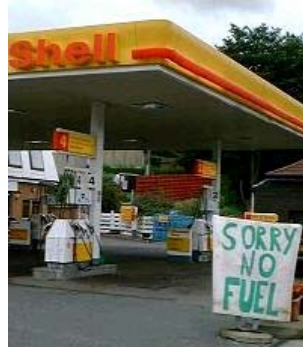
The results of a recent Shell driver strike, resulting in inflated prices and limited supplies.

(the Organisation of Petroleum Exporting Countries) has the world pretty much over a barrel, so to